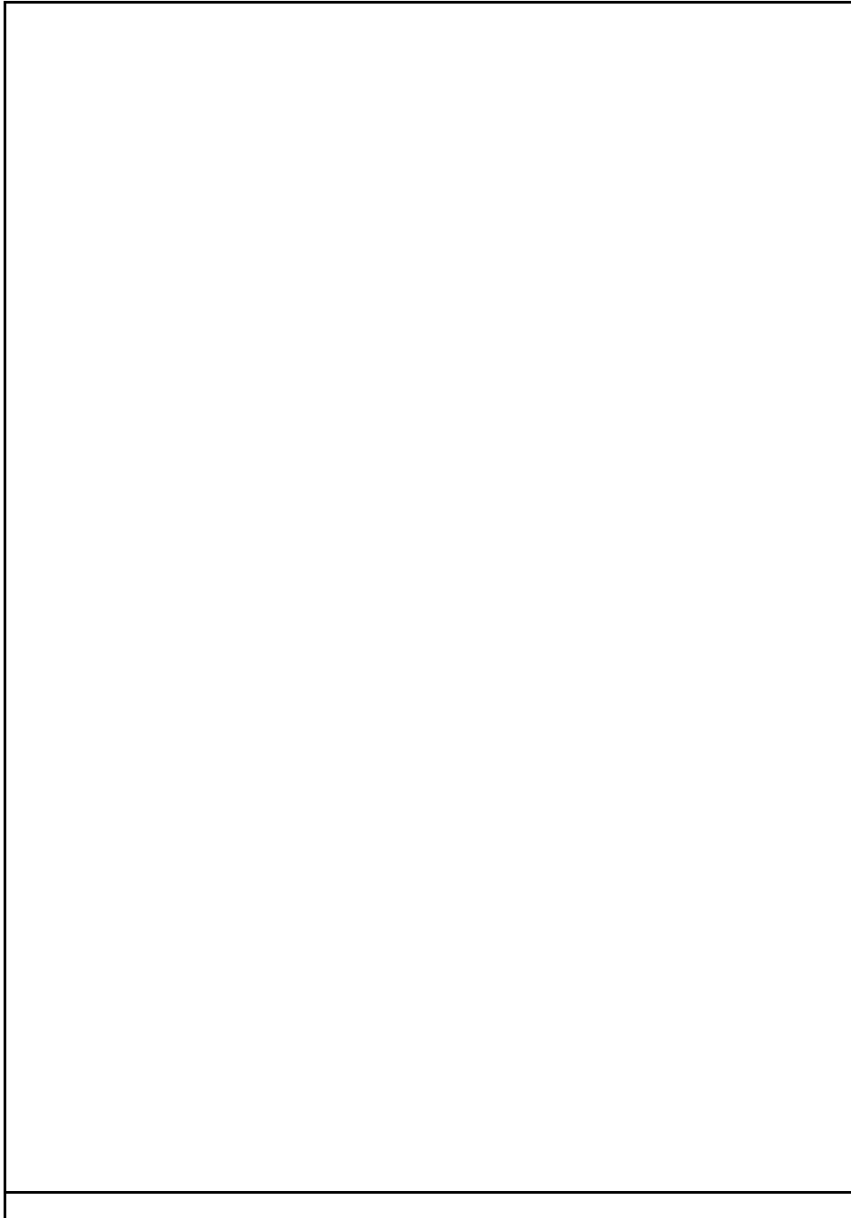
Figure 2 Segregation of chromosome 1p34.1-p32 markers in the Spanish families S113, S601, S150, and S517. Lipid values given under each family-member symbol are ( top to bottom ): age at lipid measurement levels of total, LDL, and HDL cholesterol (in grams per liter); and levels of triglycerides in (grams per liter). Haplotypes ( top to bottom ) at tel- D1S472-D1S2892-D1S2722-D1S211 -cen markers are shown for each family member tested. Half-blackened symbols indicate affected members and unblackened symbols indicate unaffected members. The common region transmitted with the disease phenotype in each family is boxed.

chromosome 8, as well as the APOA1-C3-A4 gene cluster on chromosome 11 and the 1q21-q23 region, both of which are associated with familial combined hyperlipidemia (Wojciechowski et al. 1991; Pajukanta et al. 1998). Because this family was clinically and biologically indistinguishable from FH or FDB families and the expected LOD score showed sufficient power in the ped-